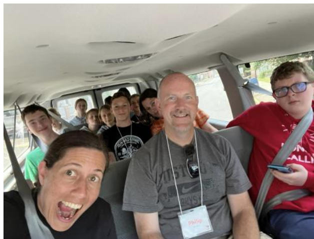
Jr. High Conference